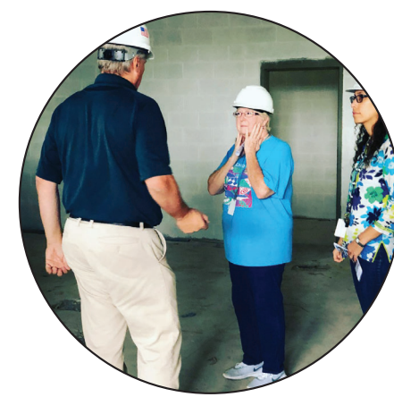
Seeing a client's eyes light up as their vision comes to life, whether rendering, Virtual Walkthroughs, or near the end of construction. There's nothing like it.

FAVORITE PART OF THE ARCHITECTURAL PROCESS: