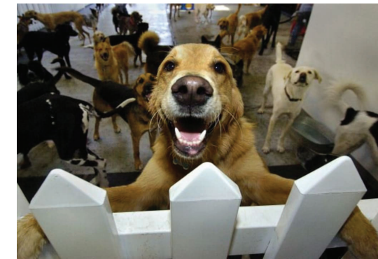
Doggie Daycare worker ^_^