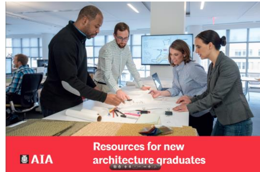
Resource Guide v2