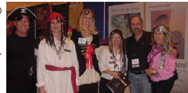
Last year's theme was Anchor's Aweigh, and many exhibitors dressed the part, including these invading pirates!