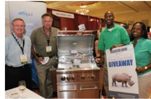
The FNGA crew and the infamous gas grill giveaway!

Diamond Sponsor - $10,000 - Sponsorship of one of the major AIA Florida Programs and Convention events – the Design & Honor Awards Program and the Gala Awards Dinner. Receive recognition and exposure throughout the year.