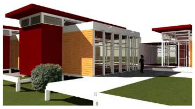
2009 Design Competition