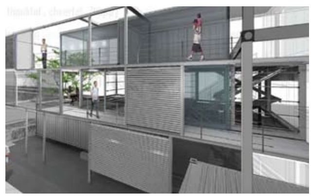
2010 Design Competition

Winners will be announced at the AIA Florida Annual Convention during the Foundation Luncheon at the Naples Grande Beach Resort on July 30.