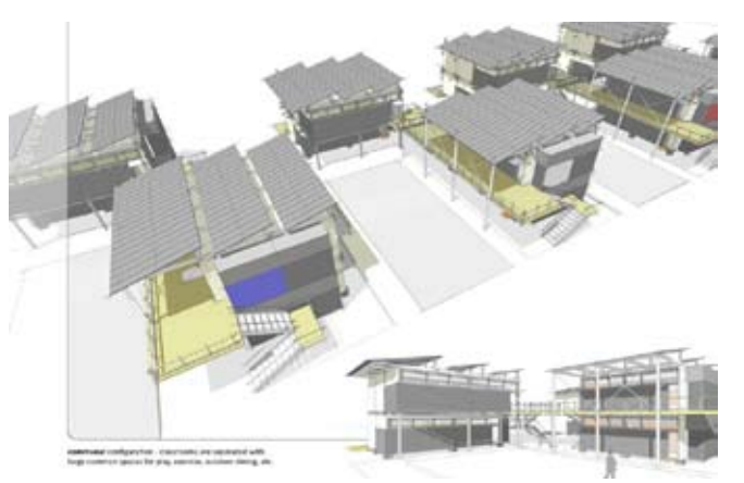
2009 Design Competition