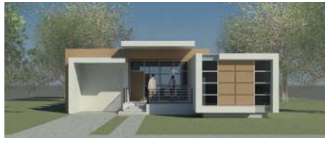
2008 Florida Cottage Design Competition