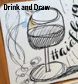
Drink and Draw