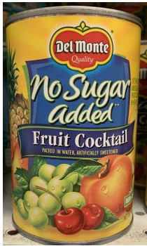
Del Monte Fruit Cocktail in Water NSA, 14.5oz $2.13ea