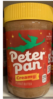
Peter Pan Creamy Peanut Butter, 16.3oz $3.40ea