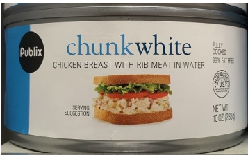
Publix Chunk White Chicken Brst, 10oz $2.39ea