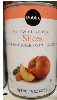
Publix Peach Slices in 100% Juice, 15oz $1.45ea