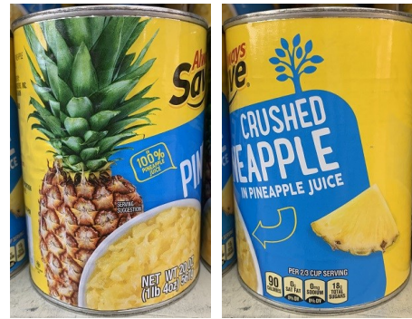
Always Save Crushed Pineapple in Juice, 20oz $0.99ea