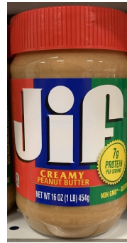
Jif Creamy Peanut Butter, 16oz $2.72ea