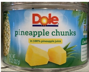
Dole Pineapple Chunks in 100% Juice, 8oz $1.05ea