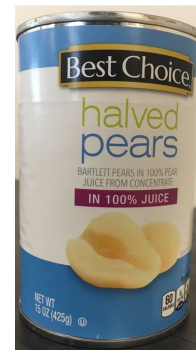
Best Choice Halved Pears in 100%, 15oz $1.32ea