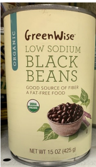
Greenwise Organic Black Beans LS, 15oz $1.29ea