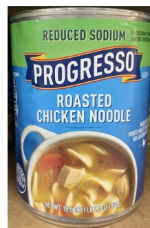
Progresso Roasted Chicken Noodle RS, 18.5oz $2.39ea