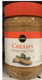
Publix Creamy Peanut Butter, 18oz $2.79ea