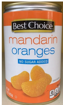
Best Choice Mandarin Oranges NSA, 15oz $1.48ea