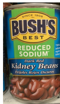
Bush's Drk Rd Kidney Beans RS, 16oz $1.16ea