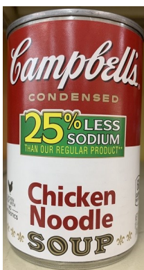
Campbell's Chicken Noddle 25% LS, 10.75oz $1.43ea