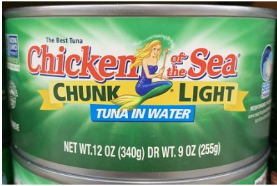
Chicken of the Sea Chunk Lt Tuna in Water, 12oz $2.24ea