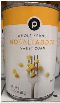
Publix Whole Kernel Sweet Corn NSA, 15oz $0.89ea