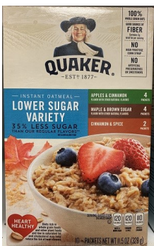
Quaker Instant Oat- meal LS Variety, 10 packs, 11.5oz $4.29ea