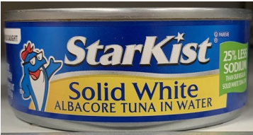
StarKist Solid White Tuna in Water 25% LS, 5oz $1.99ea