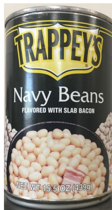
Trappey's Navy Beans, 15.5oz $1.13ea