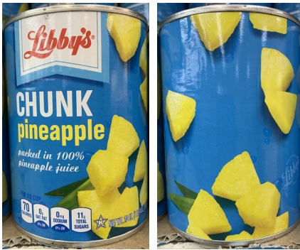
Libby's Chunk Pineapple in 100% Juice, 20oz $1.38ea