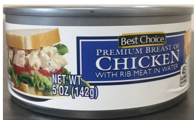
Best Choice Pm Breast Chicken, 5oz $1.07ea