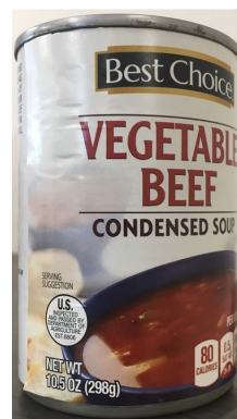
Best Choice Vegetable Beef, 10.5oz $1.15ea