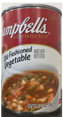
Campbell's Old Fashioned Vegetable, 10.5oz $1.43ea