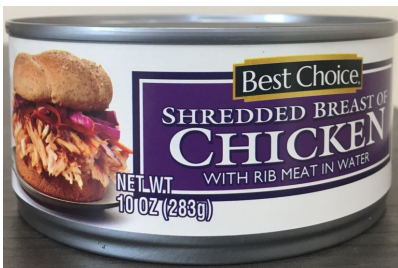
Best Choice Shrd Breast Chicken, 10oz $1.93ea