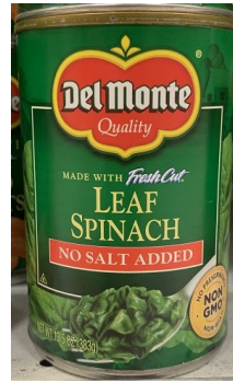
Del Monte Leaf Spinach NSA, 13.5oz $1.45ea