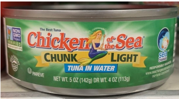
Chicken of the Sea Chunk Lt Tuna in Water, 5oz $0.99ea