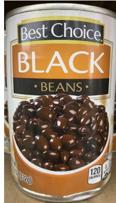
Best Choice Black Beans, 15oz $1.15ea