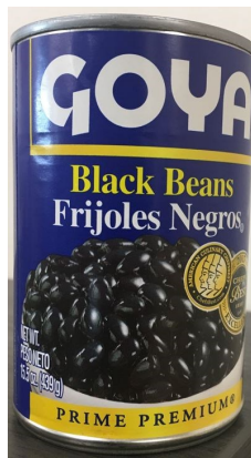
Goya Black Beans, 15.5oz $1.27ea