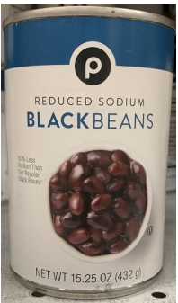
Publix Black Beans RS, 15.25oz $0.85ea