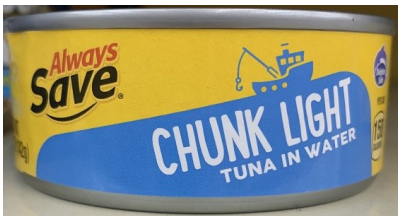
Always Save Chunk Lt Tuna in Water, 5oz $0.79ea