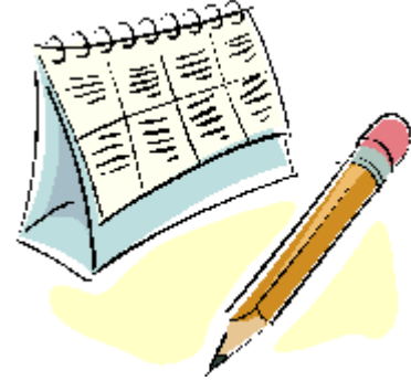
Click on the image to view the AIA Florida calendar of events.